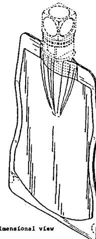
Three dimensional view

57: The design is for a drinking pouch having a body consisting of two identical flexible sheets which are connected together along their matching peripheries, to define a liquid holding cavity between the sheets. The body has a generally rectangular outline when viewed front-on, tapering somewhat from bottom to top. Upper and lower edges of a peripheral rim portion, where the sheets are connected, are straight, with two symmetrical part-circular recesses being defined in side edges of the peripheral rim portion, so that the pouch has a slight waist. A mouth is defined in the upper edge of the rim portion, the mouth allowing passage to a slot in the body of the pouch, the volume of the slot defining an inverted cone-shaped rise in an upper third of front and rear surfaces of the pouch.