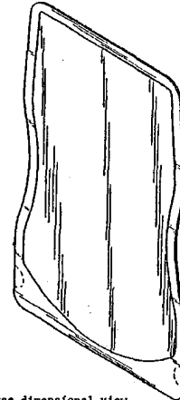
Three dimensional view

57: The design is for a drinking pouch having a body consisting of two identical flexible sheets which are connected together along their matching peripheries, to define a liquid holding cavity between the sheets. The body has a generally rectangular outline when viewed front-on, tapering somewhat from bottom to top. Upper and lower edges of a peripheral rim portion, where the sheets are connected, are straight, with two symmetrical part-circular recesses being defined in side edges of the peripheral rim portion, so that the pouch has a slight waist.