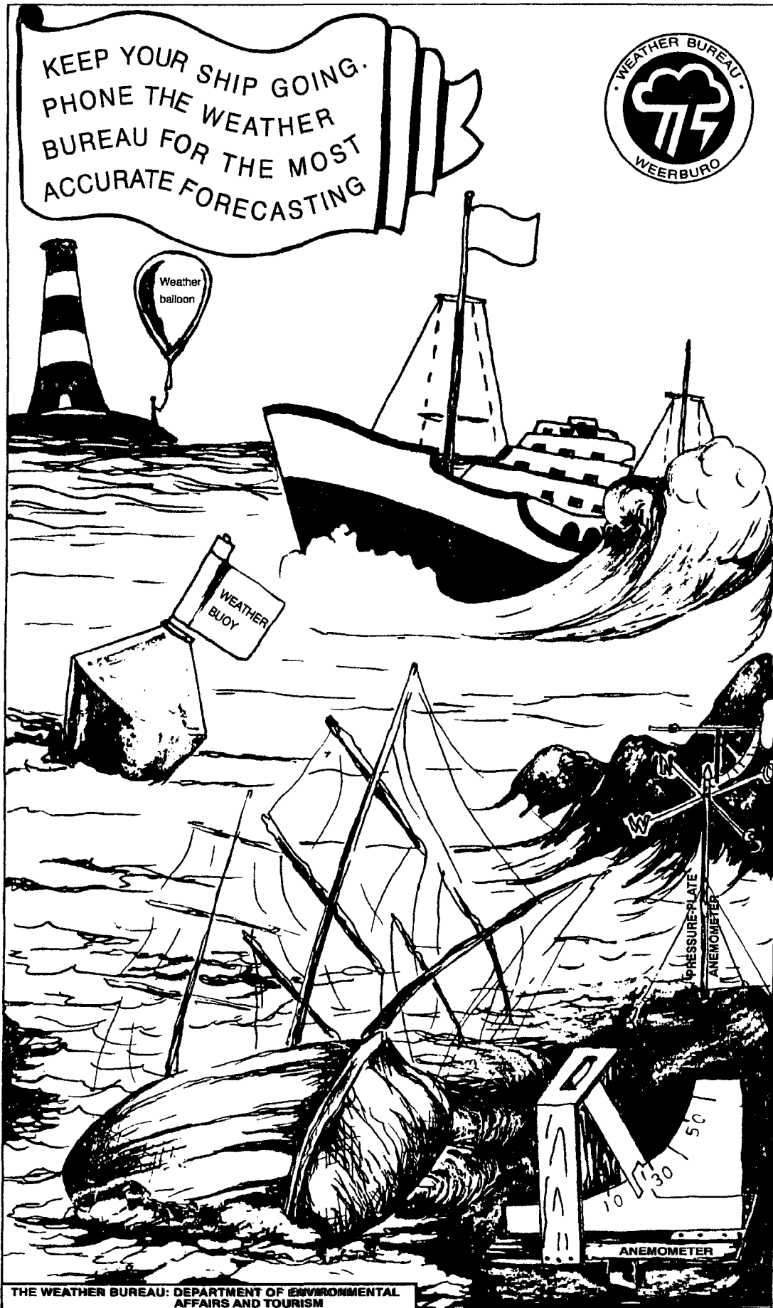
THE WEATHER BUREAU: DEPARTMENT OF ENVIRONMENTAL AFFAIRS AND TOURISM