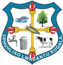
INGQUZA HILL LOCAL MUNICIPALITY