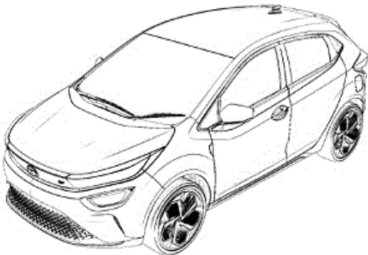
FRONT PERSPECTIVE VIEW

57: The design relates to a vehicle. The features of the design are those of shape and/or configuration and/or ornamentation.